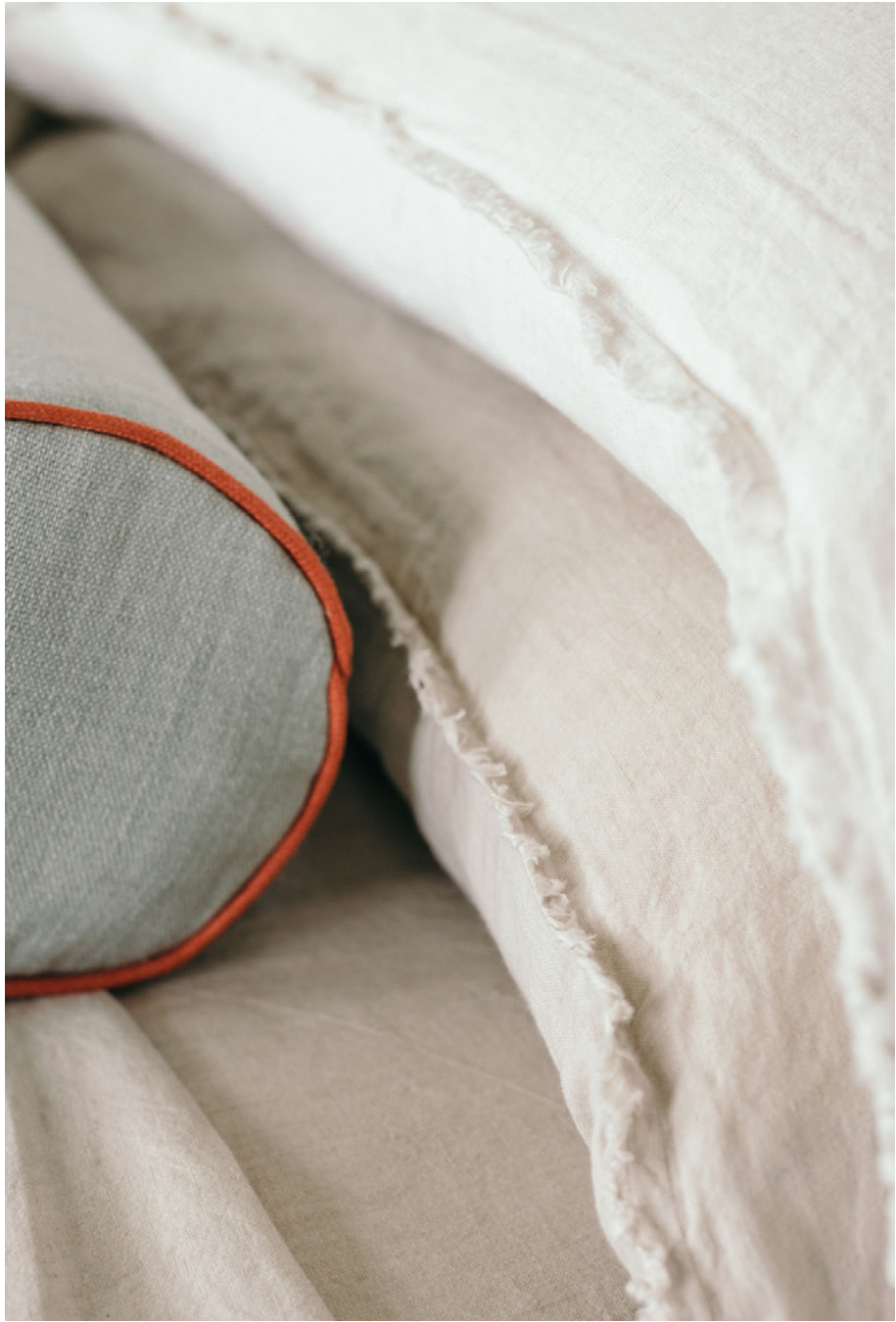
FLOCCA PILLOWCASE PAIR @