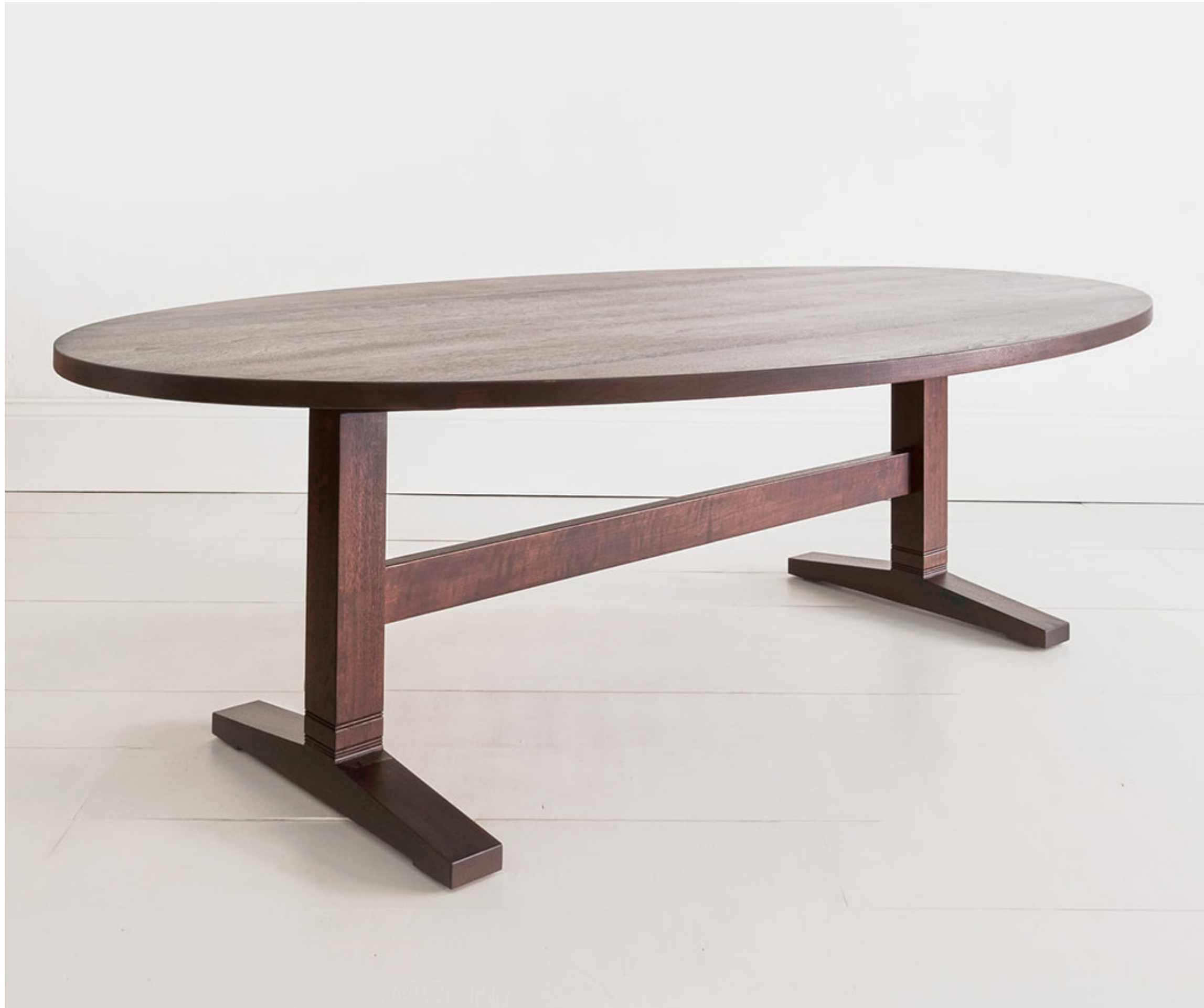
OVAL TRESTLE DINING TABLE