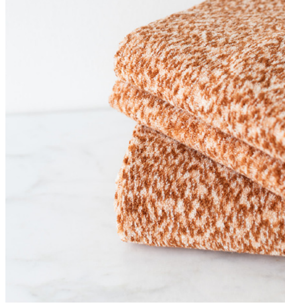
SPACE DYE TERRY TOWELS ②