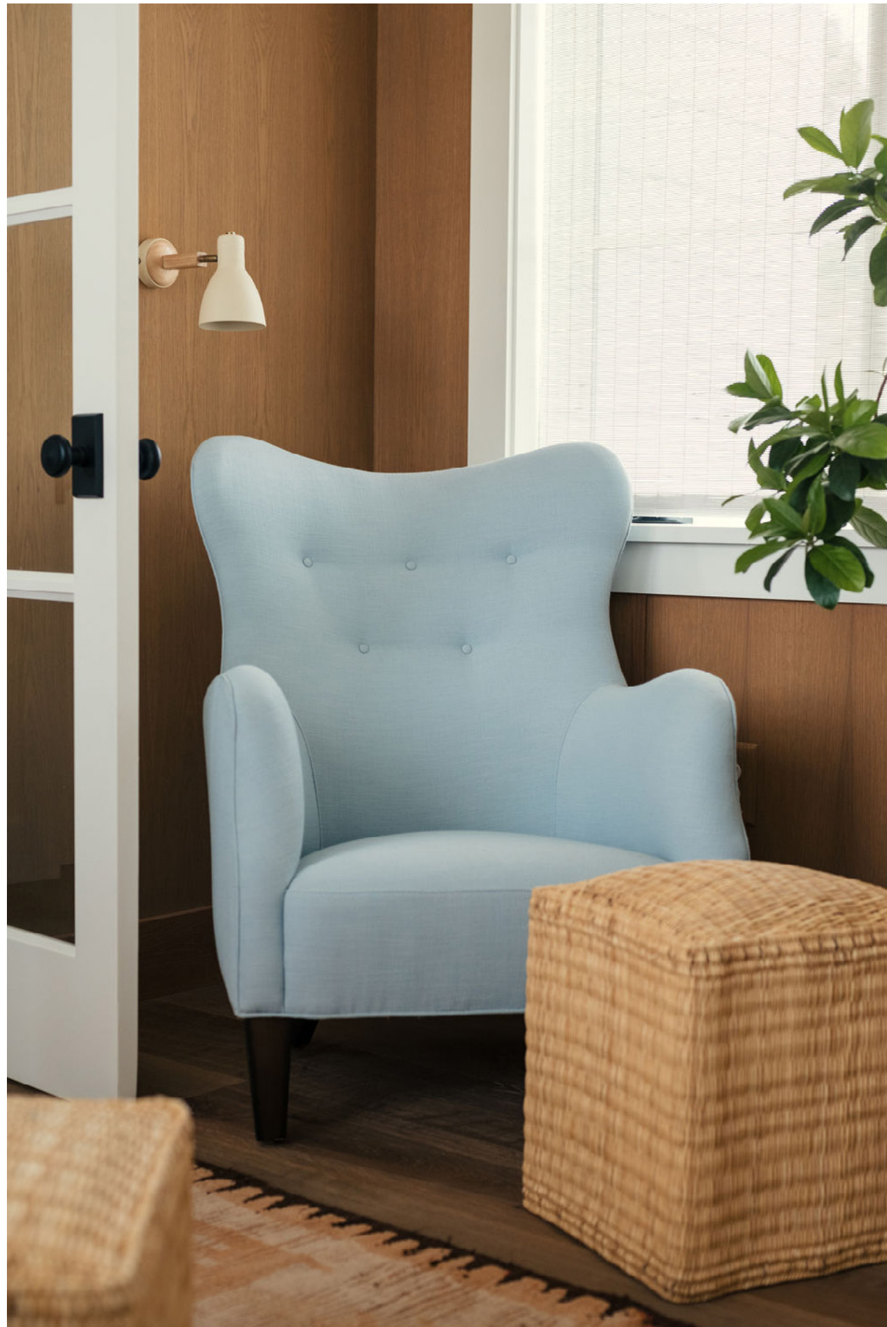
VINTAGE TURKISH RUGS @