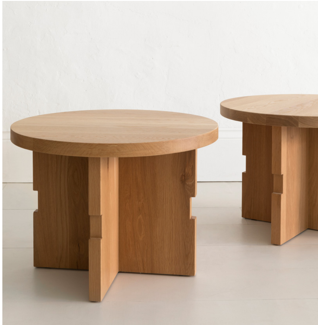
NOTCH SIDE TABLE

Customizable by size and finish, our collection of made-to-order casegoods, Sunday (work)Shop, make for a timeless addition to the modern home. Each unique in their design, let us help you create the perfect heirloom piece for your next project.