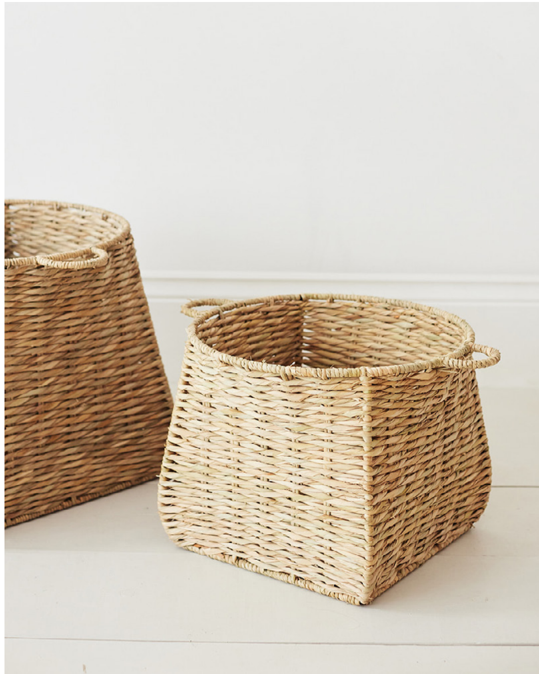
WOVEN MEXICAN SQUARE BASKETS ②