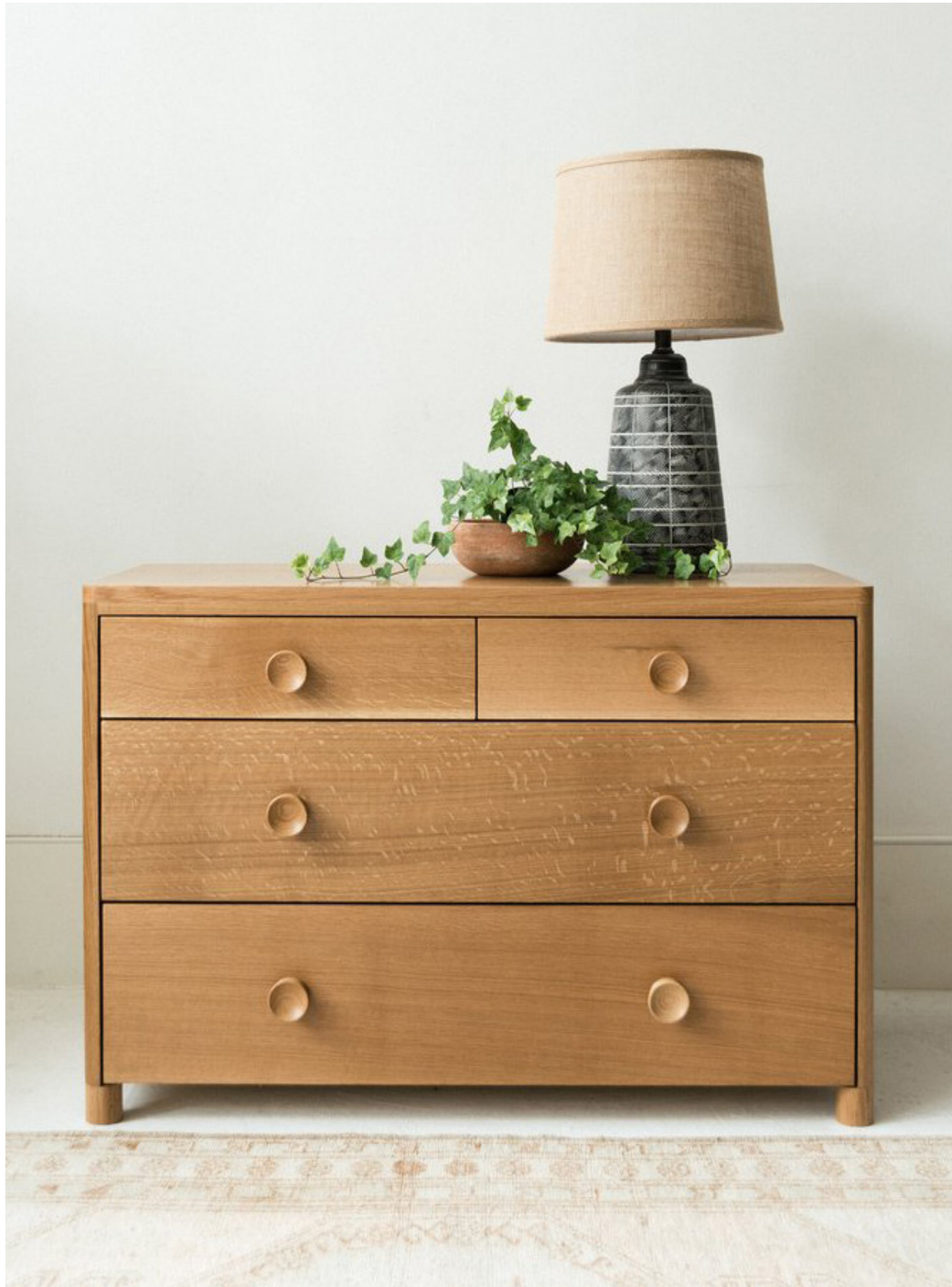
CLIO DRESSER PARIS CHAIR