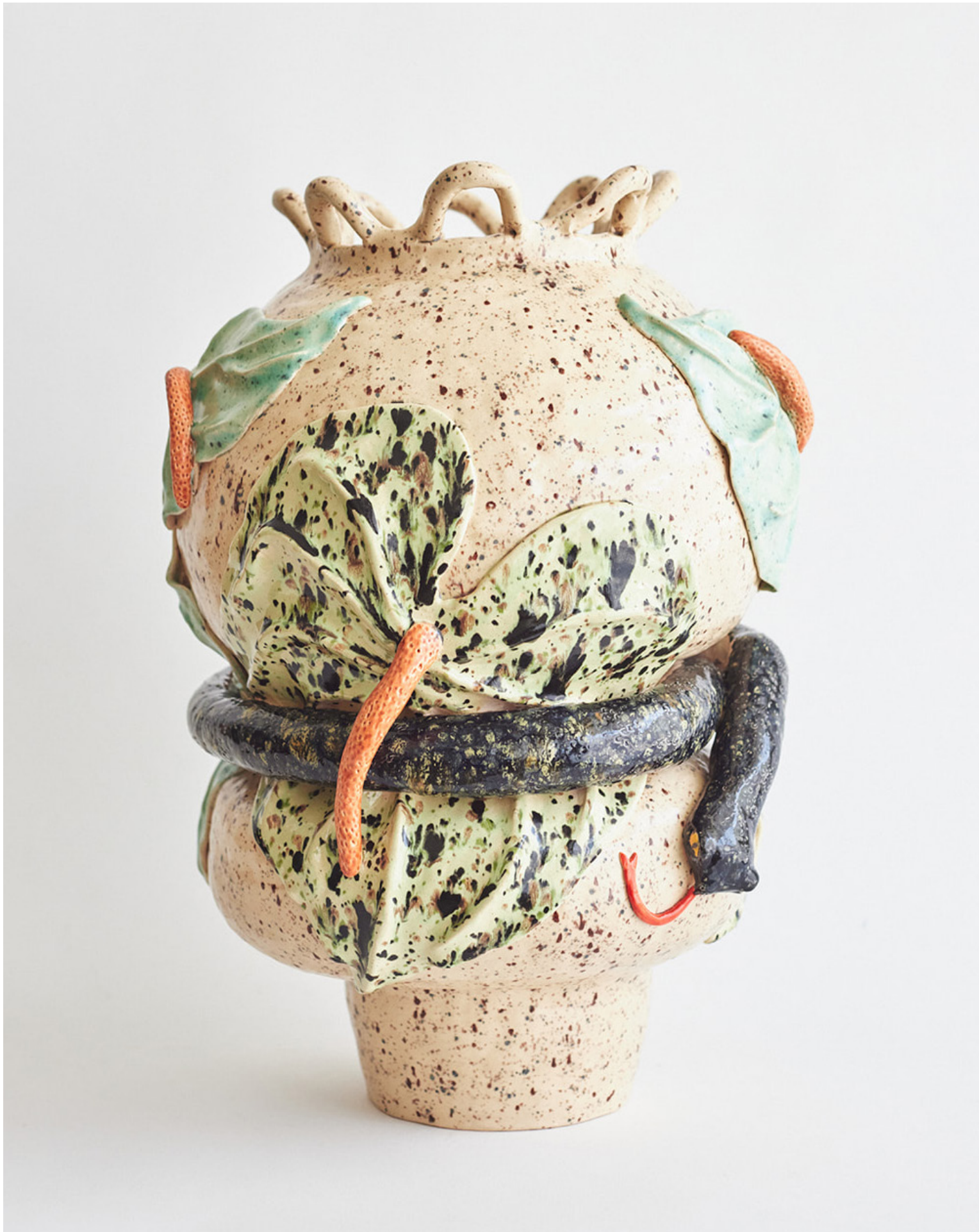
SNAKE VESSEL ©