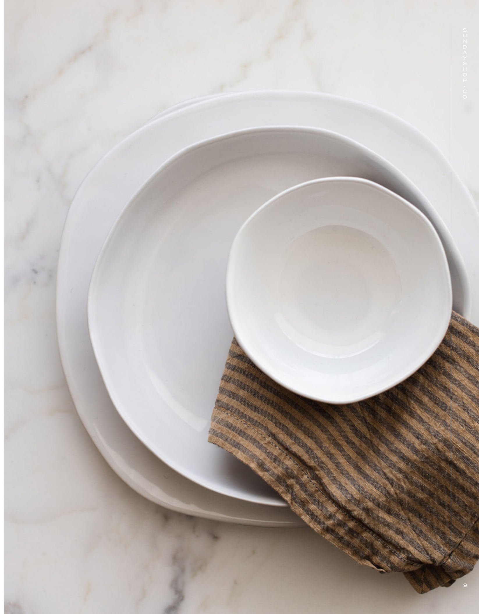
ORGANIC DINNERWARE ②