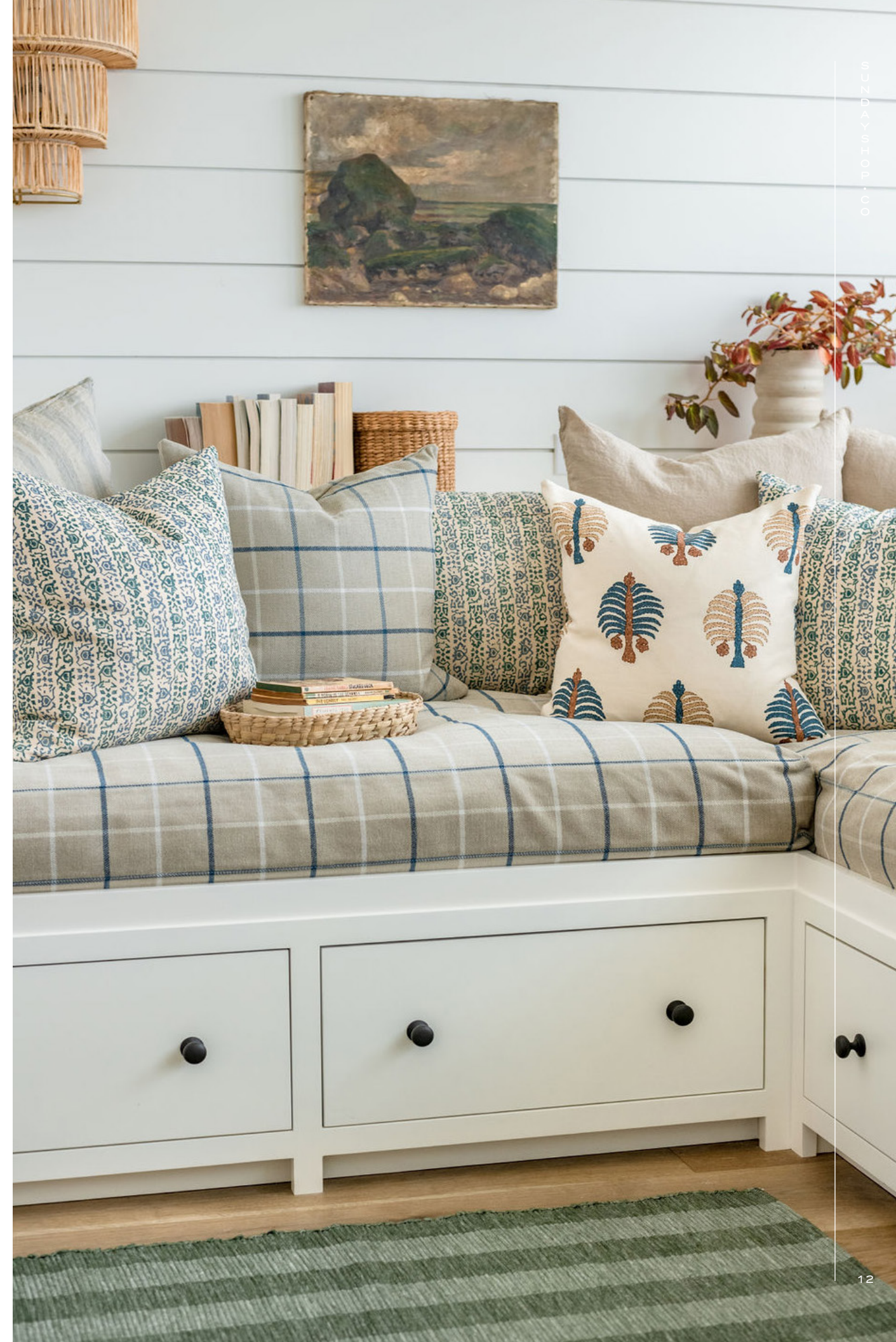
CAMEL, RUST, AND BLUE MOTIF PRINTED PILLOW ②