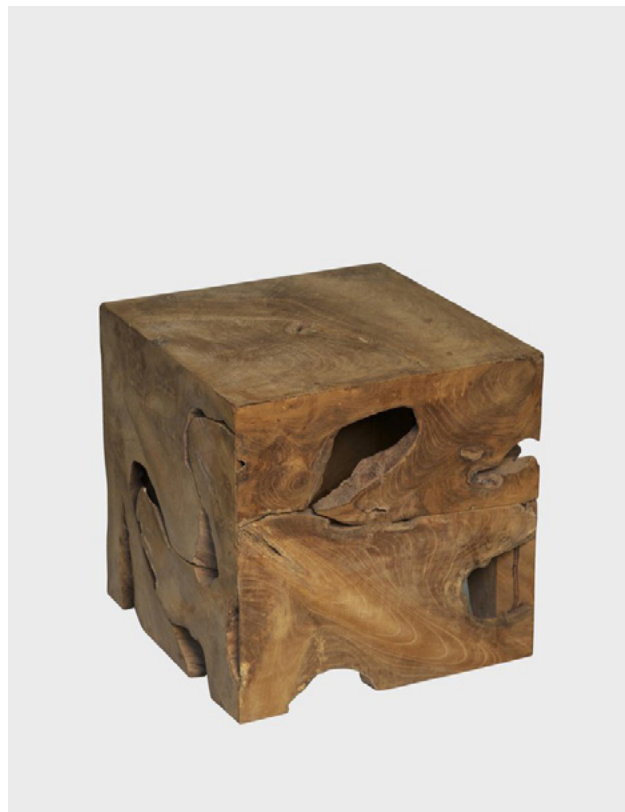
VERT SIDE TABLE ©