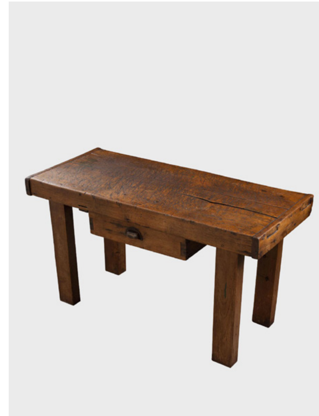
FRENCH ANTIQUE COFFEE TABLE ©