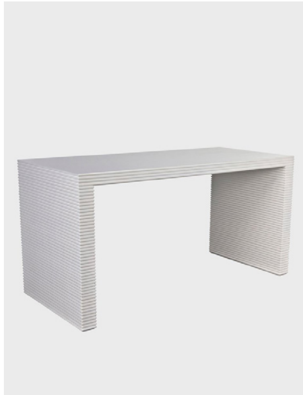
MANHATTAN DESK ©