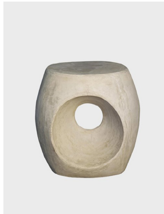
TROU STOOL ©