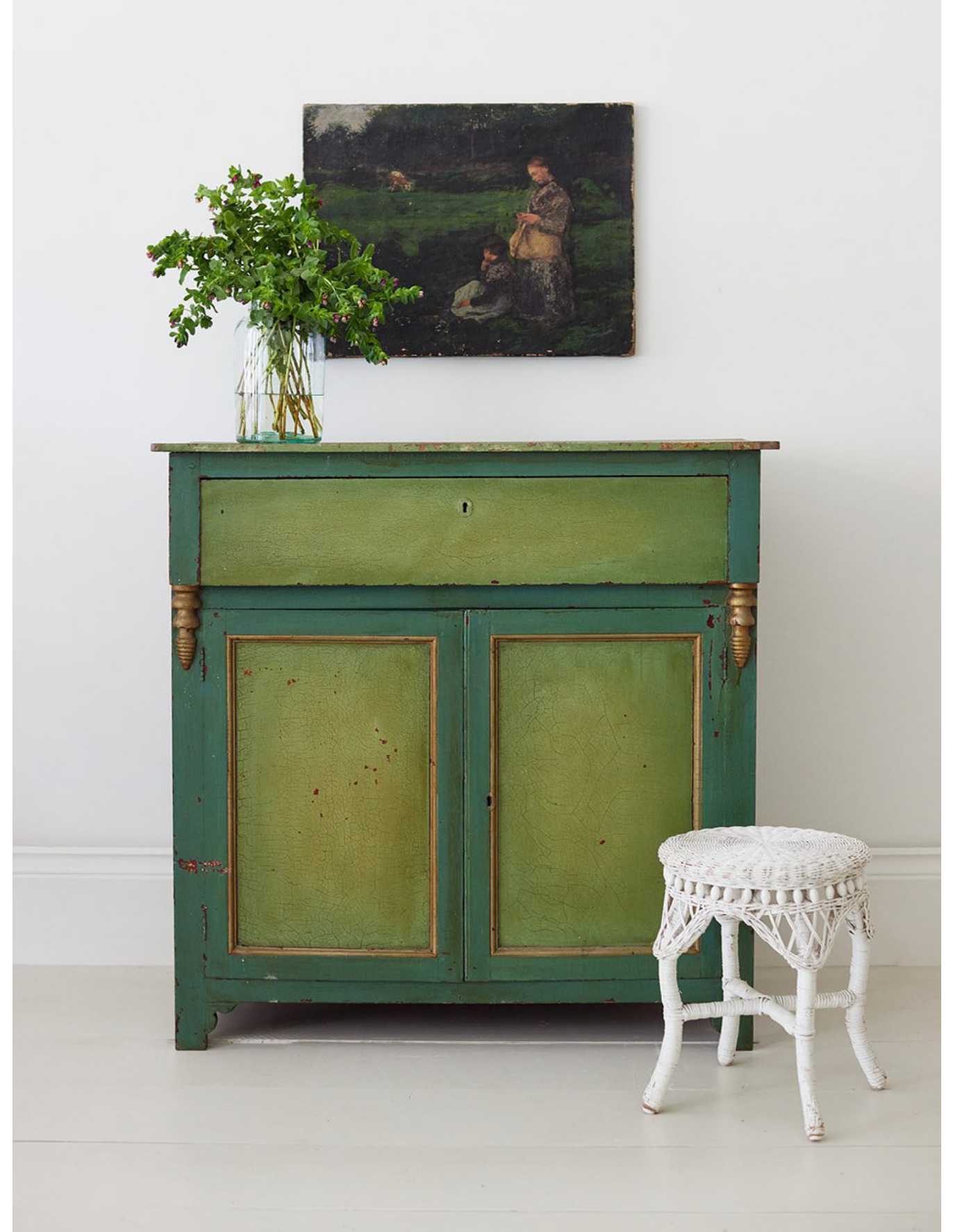
ANTIQUE DUTCH CUPBOARD