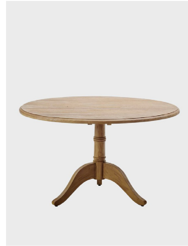
MICHEL TEAK ROUND TABLE ©