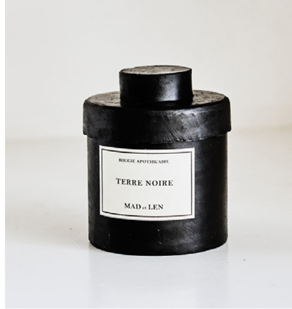
MAD ET LEN ②