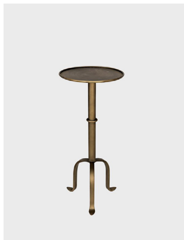
TINI SIDE TABLE, BRASS