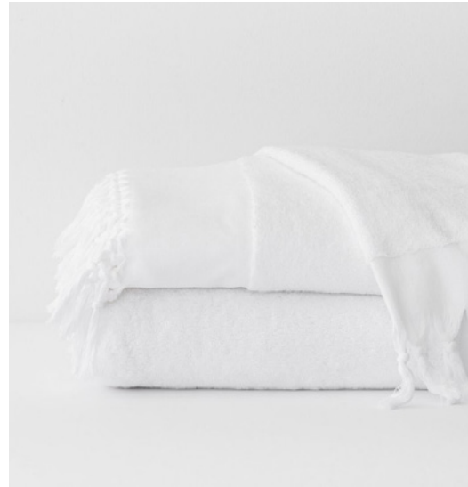
WHITE PLAIN ③