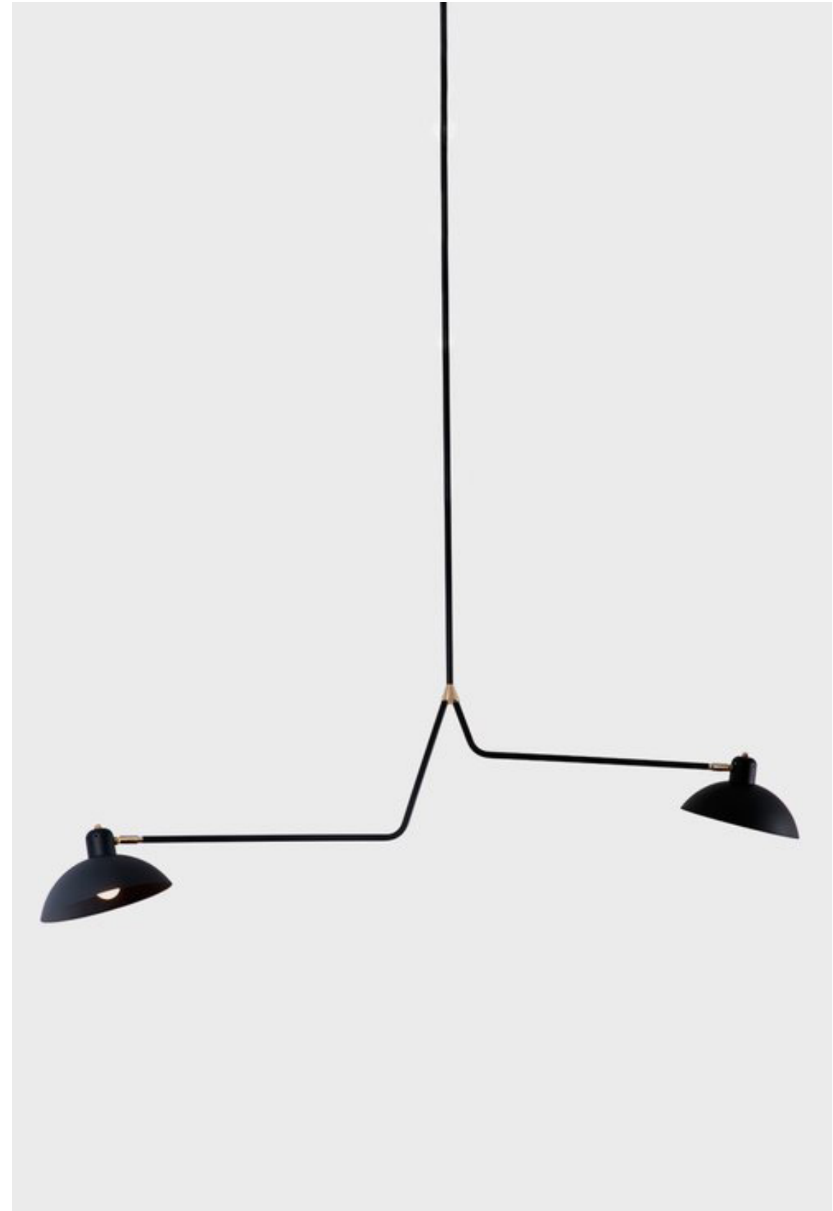
WALDORF SUSPENSION DOUBLE