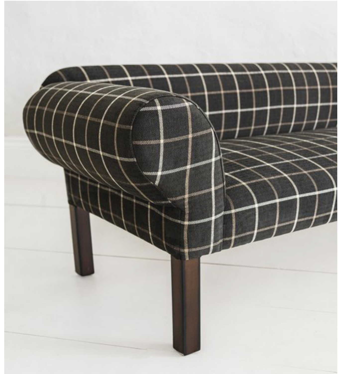
TEDDY SOFA 108"