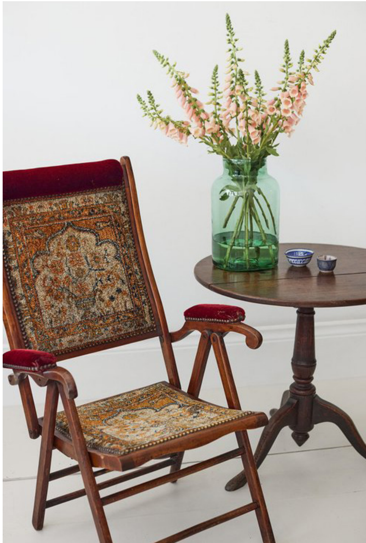
ANTIQUE ENGLISH TAPESTRY RECLINER ©