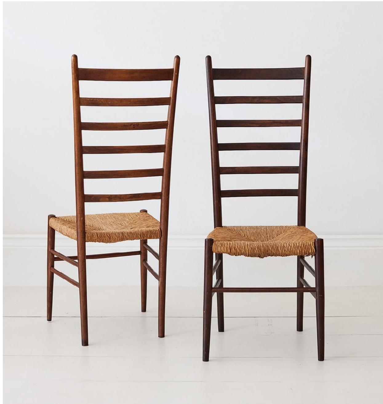
PAIR OF ITALIAN LADDERBACK CHAIRS ©