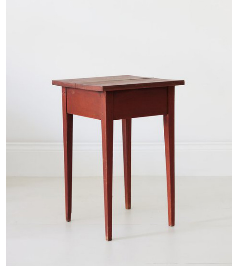
VINTAGE RED PAINTED SIDE TABLE