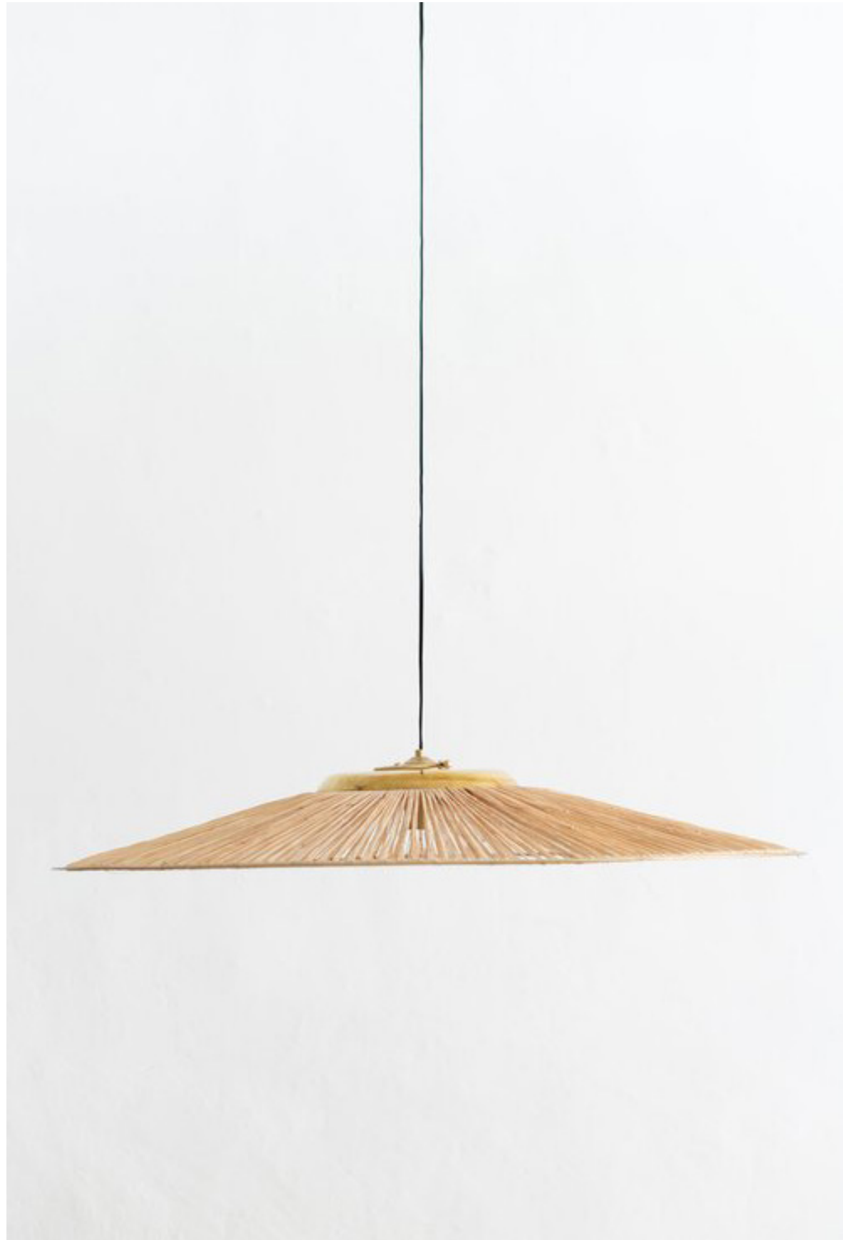
PARASOL PENDANT SHADE ②