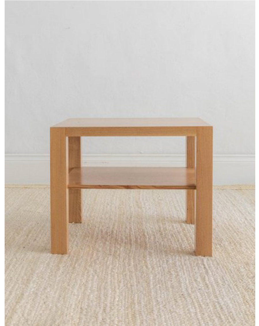
APHELEIA SIDE TABLE