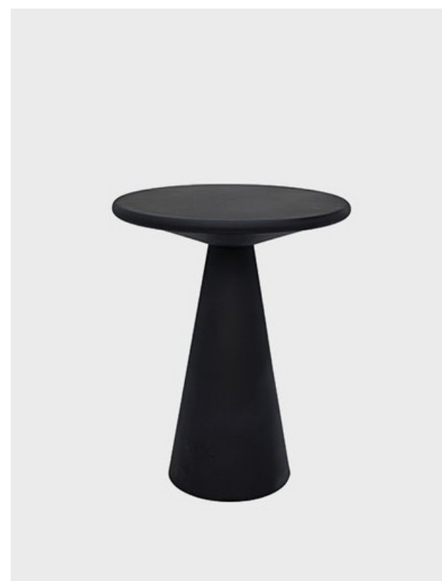
IDIOM SIDE TABLE