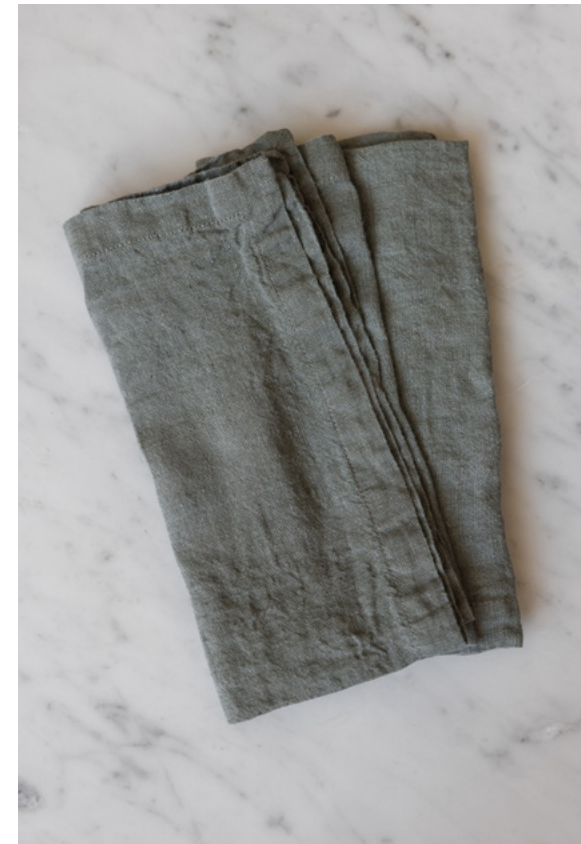
BASIX LINEN NAPKINS, MERE