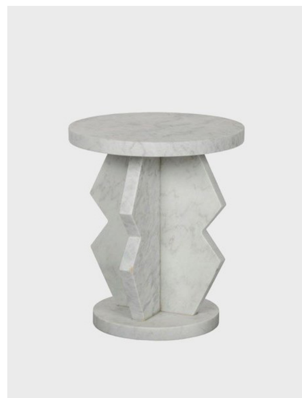
BELASCO SIDE TABLE