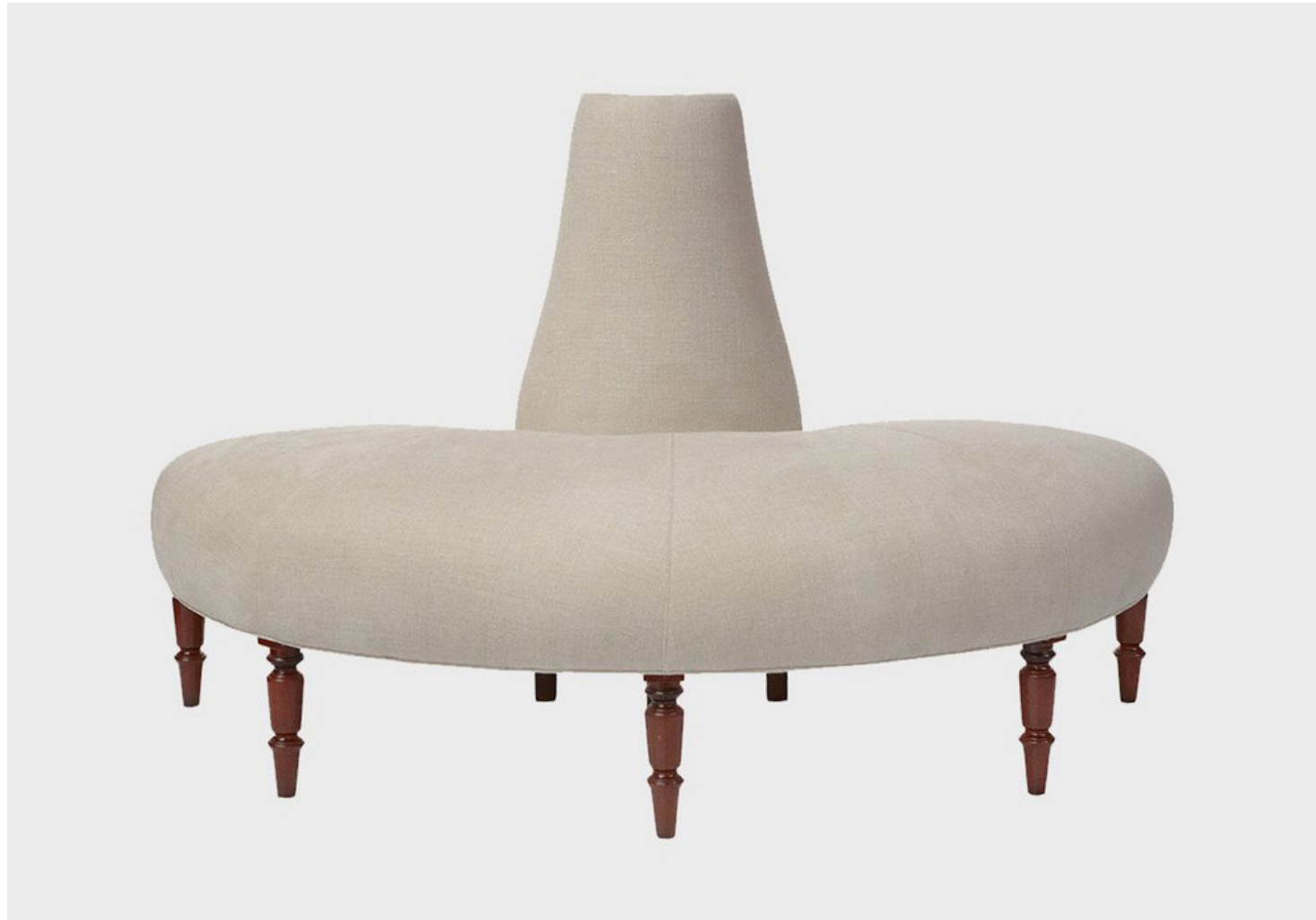
COIN HALF SOFA

Customizable by size and finish, our collection of made-to-order casegoods, Sunday (work)Shop, make for a timeless addition to the modern home. Each unique in their design, let us help you create the perfect heirloom piece for your next project.