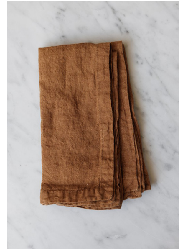
BASIX LINEN NAPKINS, RUSSO