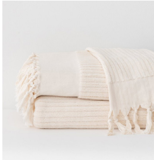
ECRU RIBBED ①

Woven by hand on traditional, shuttled looms, these Turkish cotton towels elevate the everyday to offer luxurious comfort that will not go unnoticed by guests.