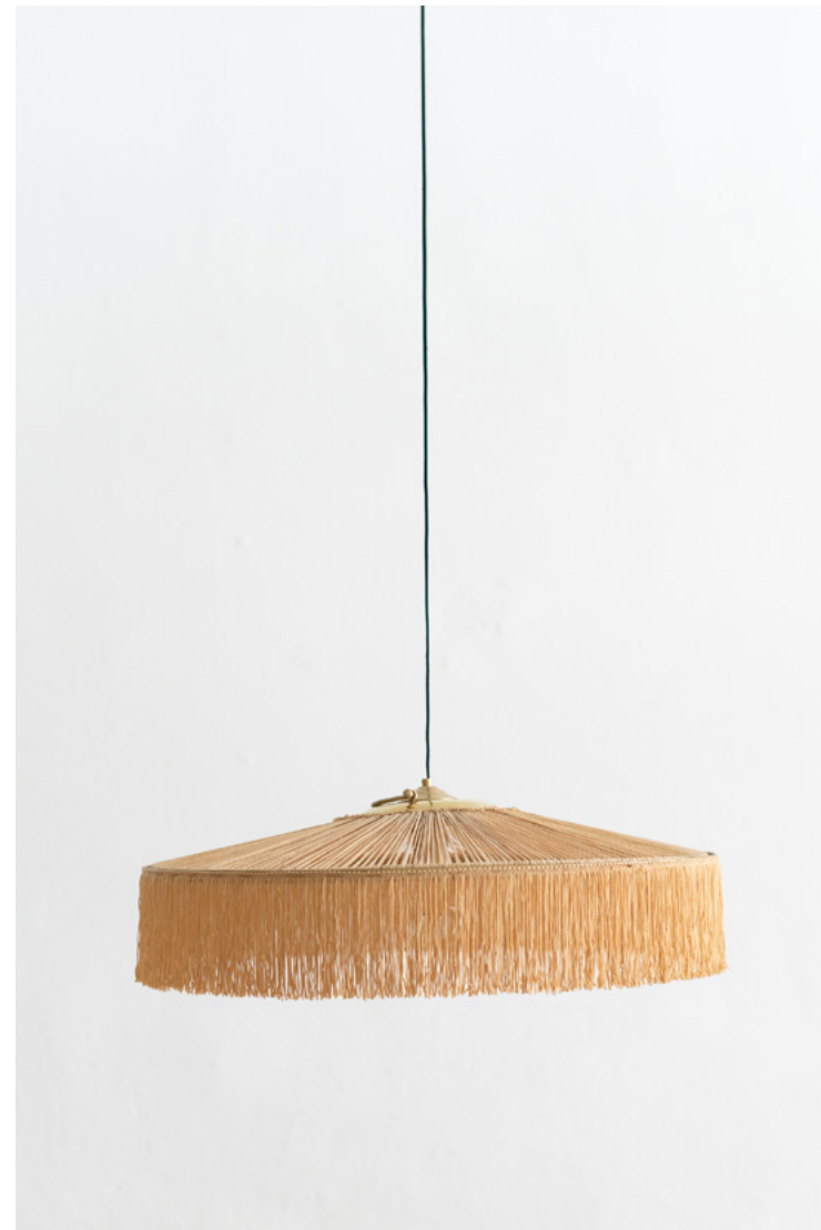
PARASOL PENDANT WITH FRINGE ©