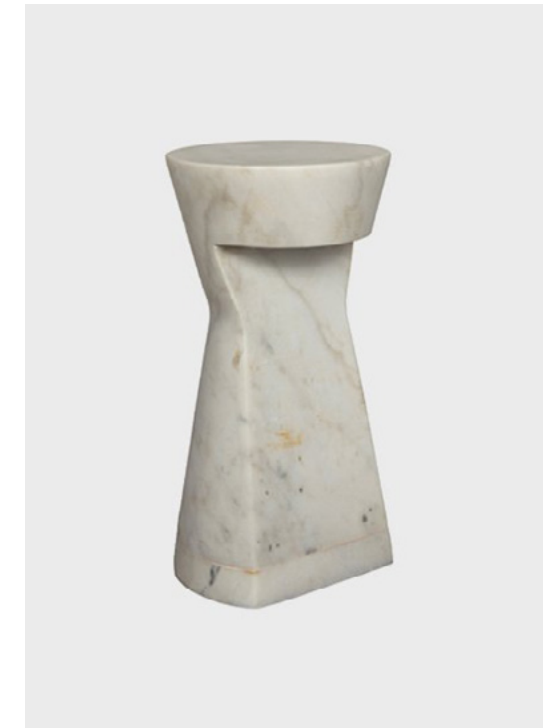
OMON SIDE TABLE ©