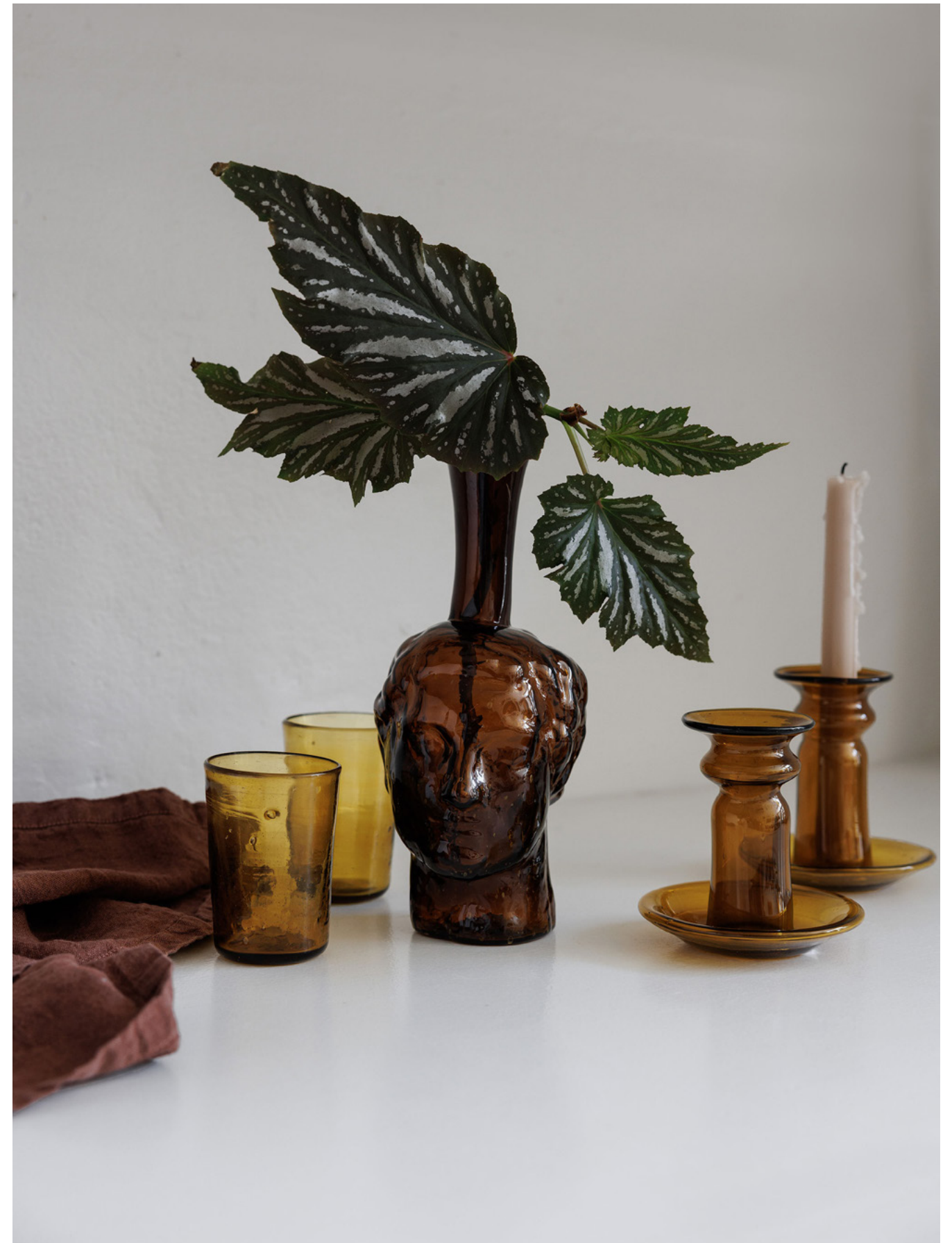
GLASSWARE AND TABLETOP BY LA SOUFFLERIE ©