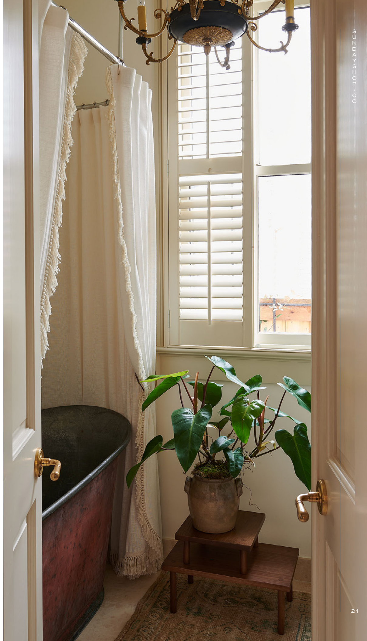
SCRAPED, BY AUGUSTA SAGNELLI @