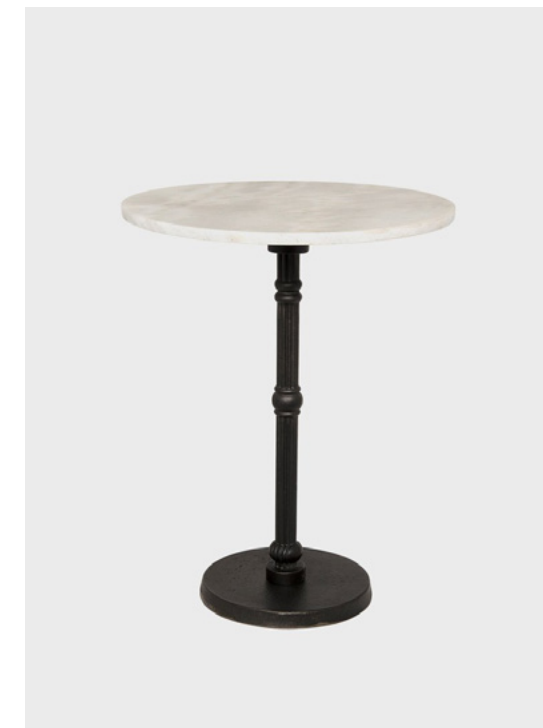
ANTONIE SIDE TABLE ©