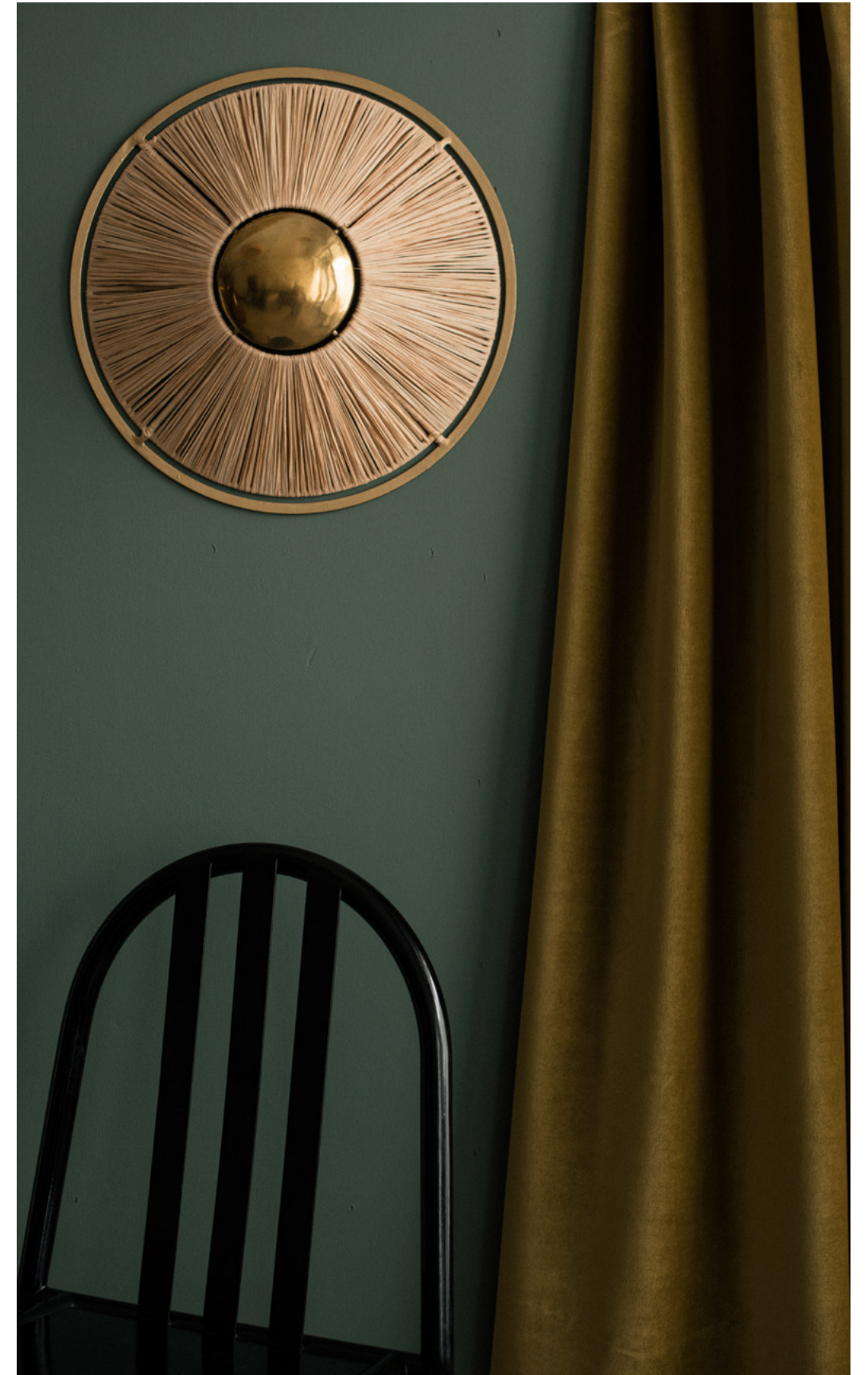
ROUND WALL SHADE ©