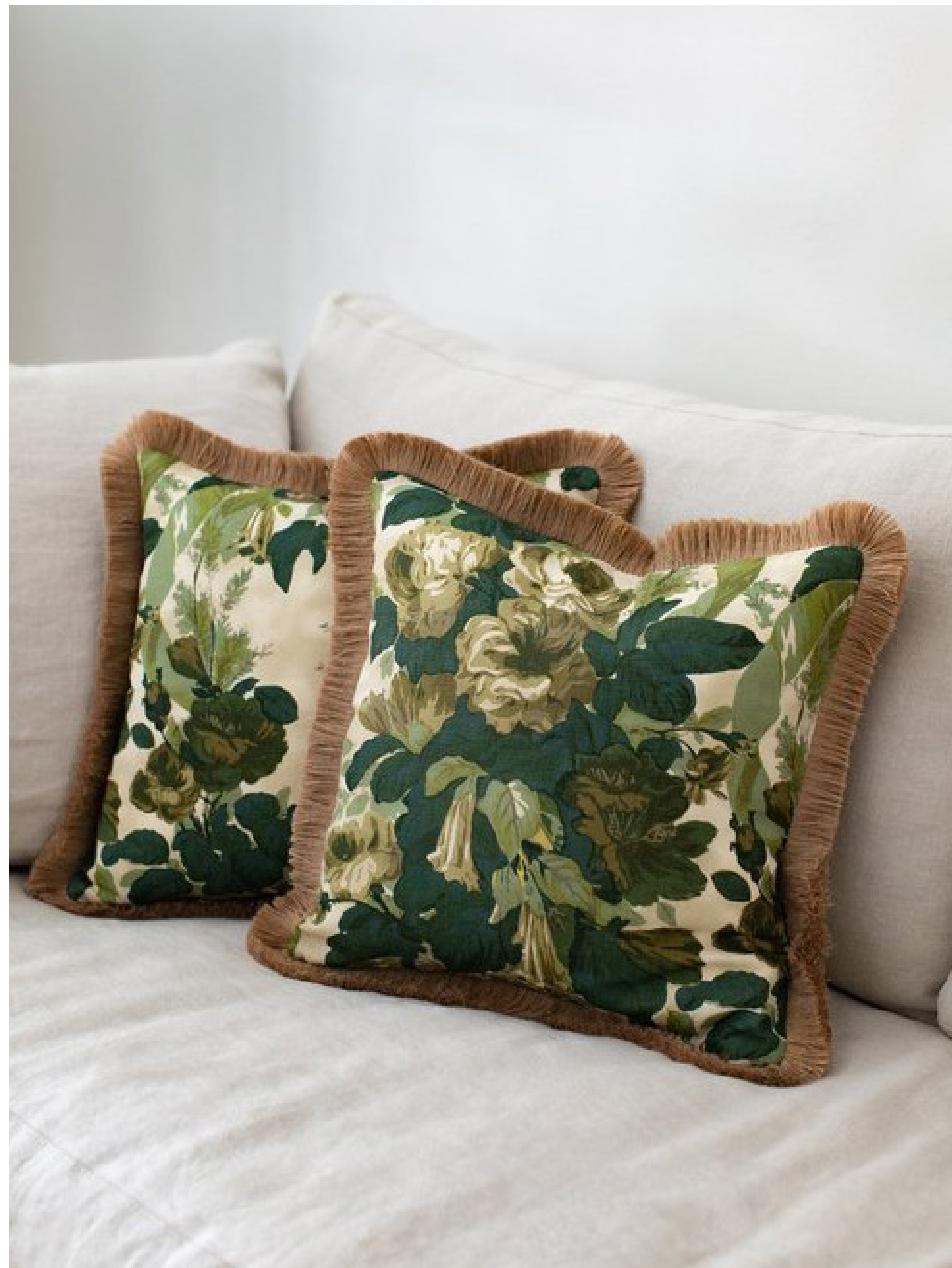
OLD WORLD PILLOW WITH BRUSH FRINGE ②

Shop our seasonal curation of custom pillows in designer fabrics. Find your final layer, all in-stock and ready to ship from our New Orleans store.