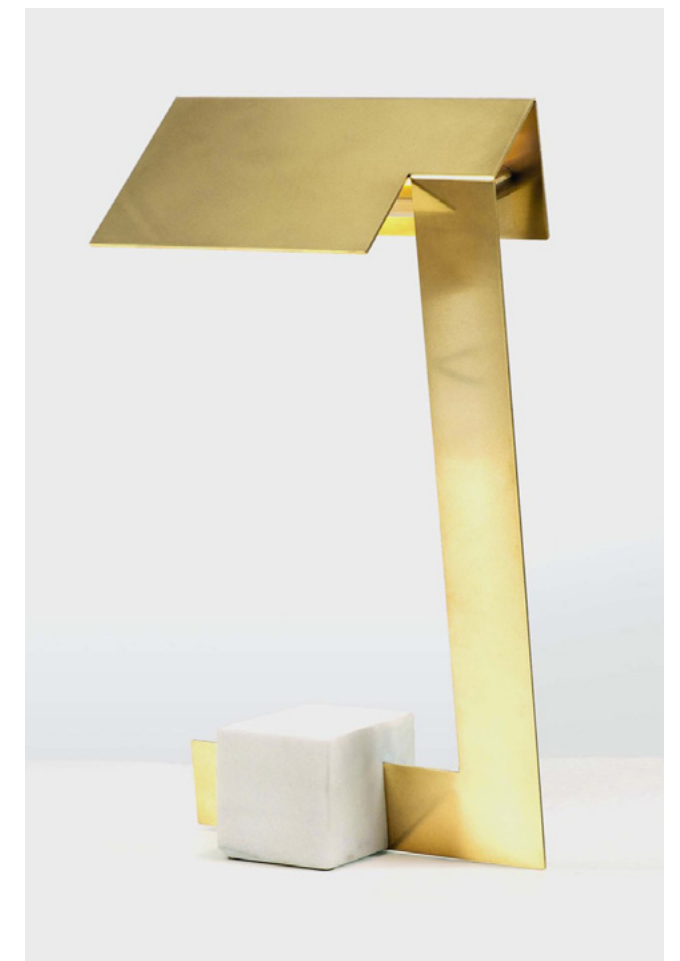
MOTIF, BY ANNA KOEFERL ©