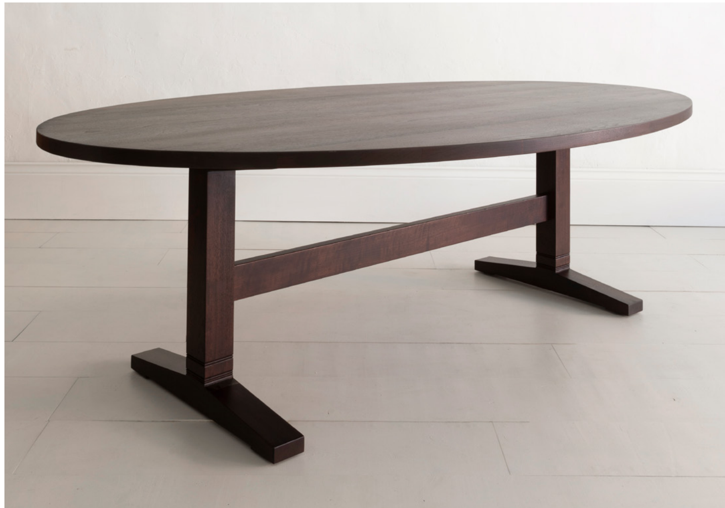
OVAL TRESTLE DINING TABLE

Customizable by size and finish, our collection of made-to-order casegoods, Sunday (work)Shop, make for a timeless addition to the modern home. Each unique in their design, let us help you create the perfect heirloom piece for your next project.