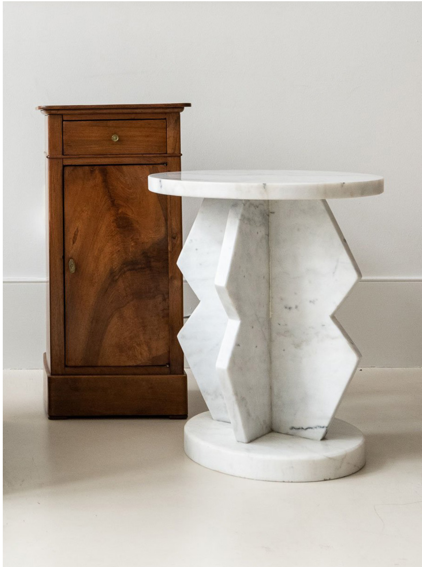
BELASCO SIDE TABLE ©