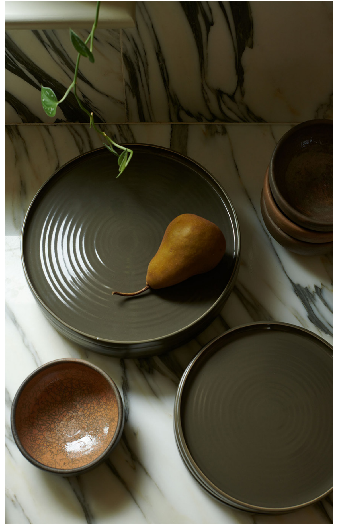
HAWKINS ESSENTIAL DINNERWARE, OLIVE