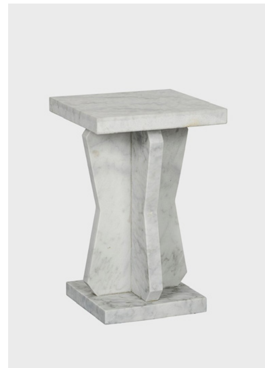
VASCO SIDE TABLE ©