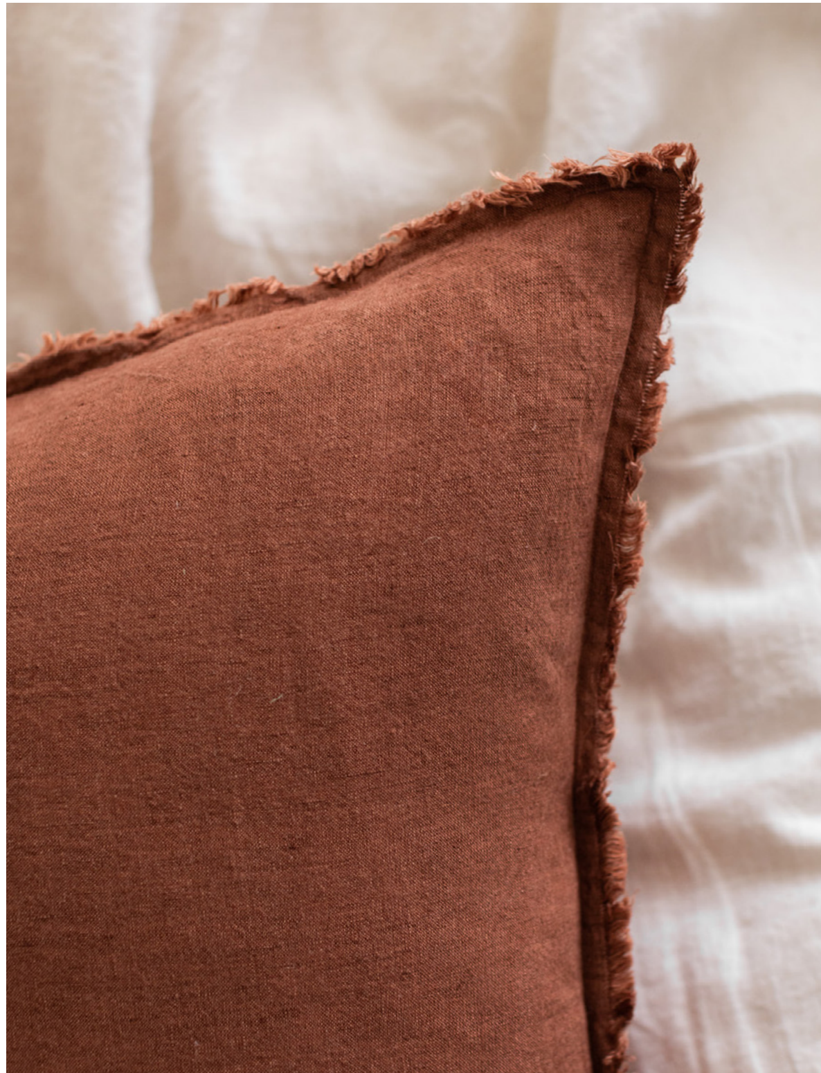
FLOCCA SQUARE LINEN CUSHION