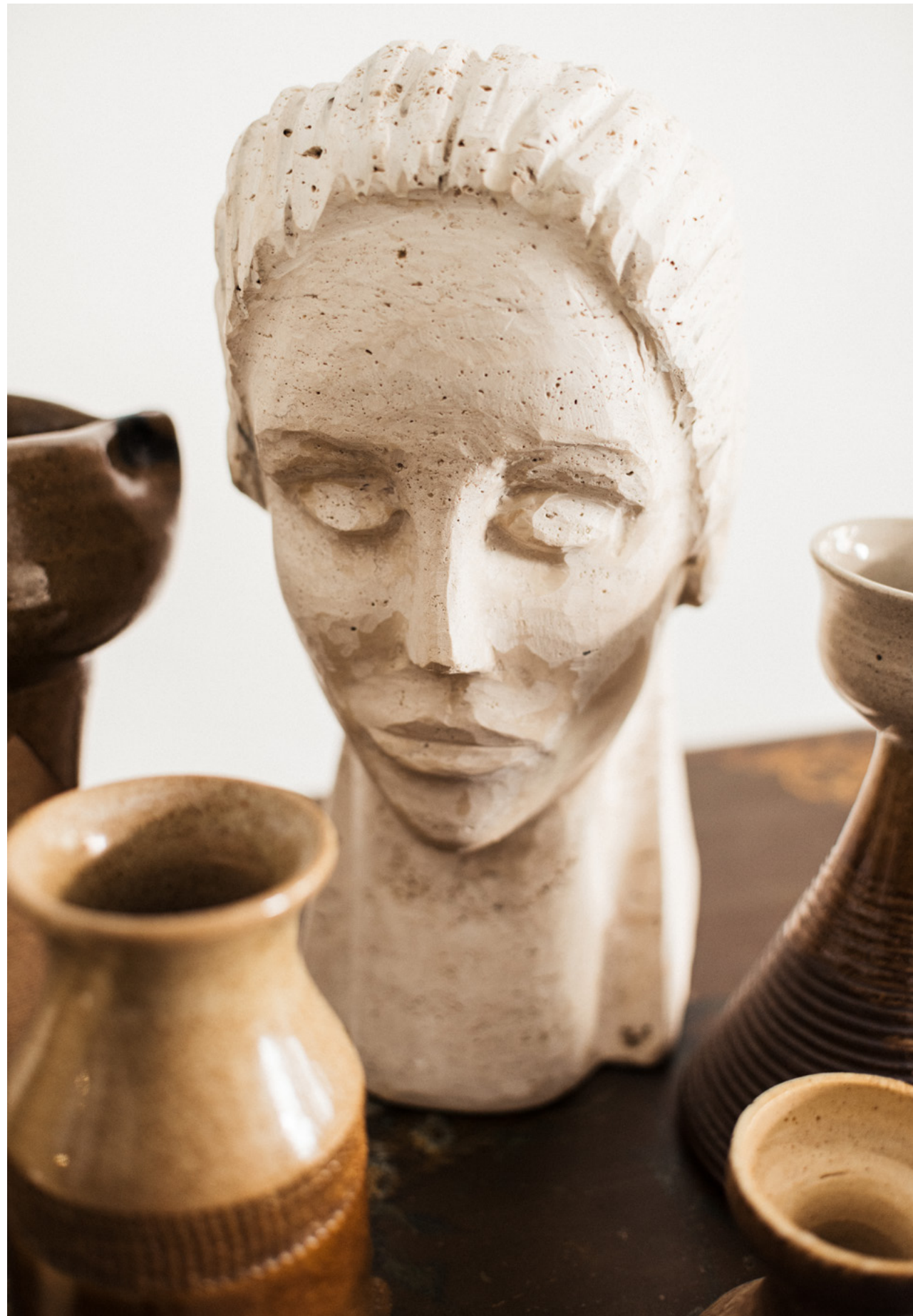
VINTAGE OBJECTS ©