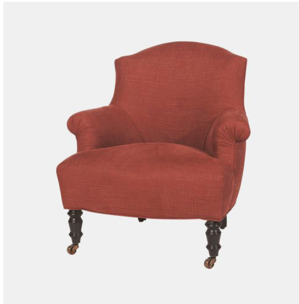
TEDDY SOFA BARONET CHAIR