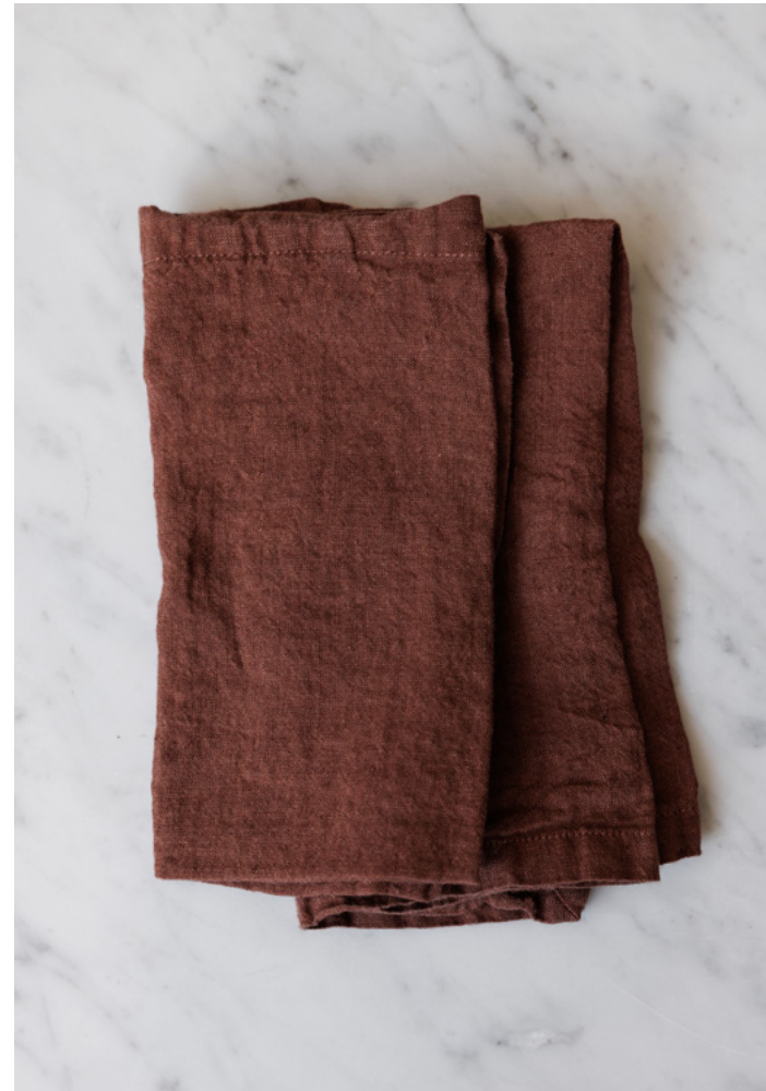
BASIX LINEN NAPKINS, MORO