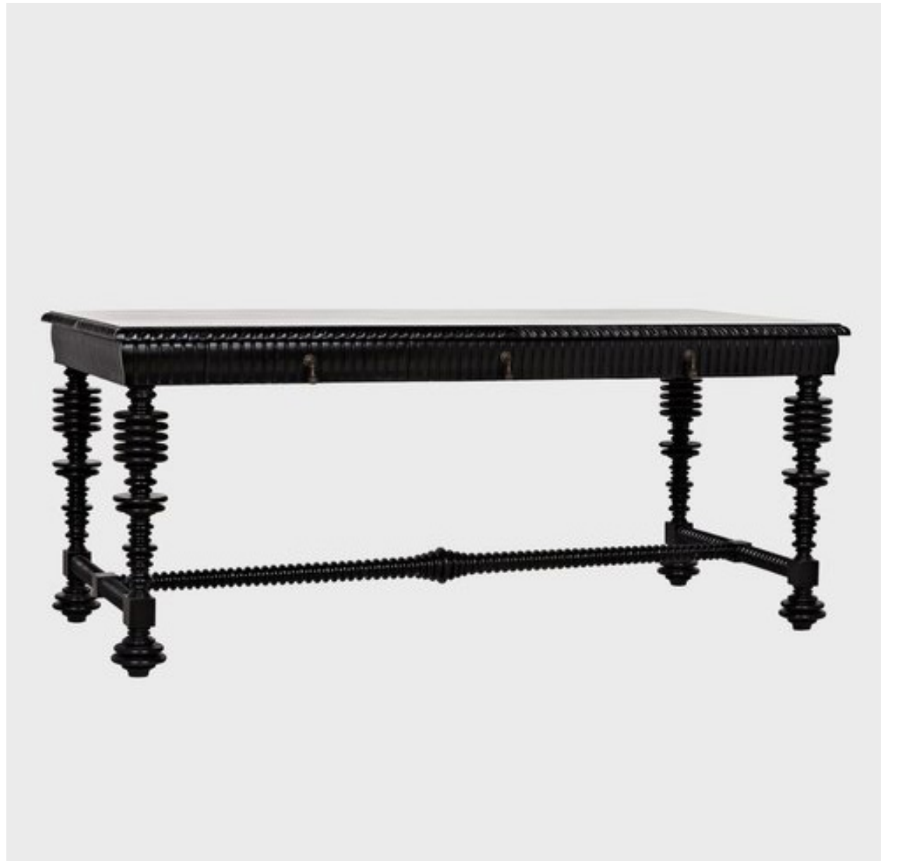
HOME FRAGRANCE PORTUGUESE DESK