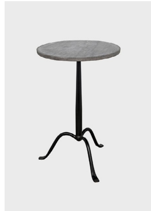
COSMOPOLITAN SIDE TABLE ©